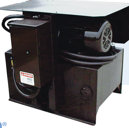
The RJ-575HD features a high-performance Marathon remote power unit with a UL and CUL listed panel box, 30 HP motor, and an external motor starter reset button.