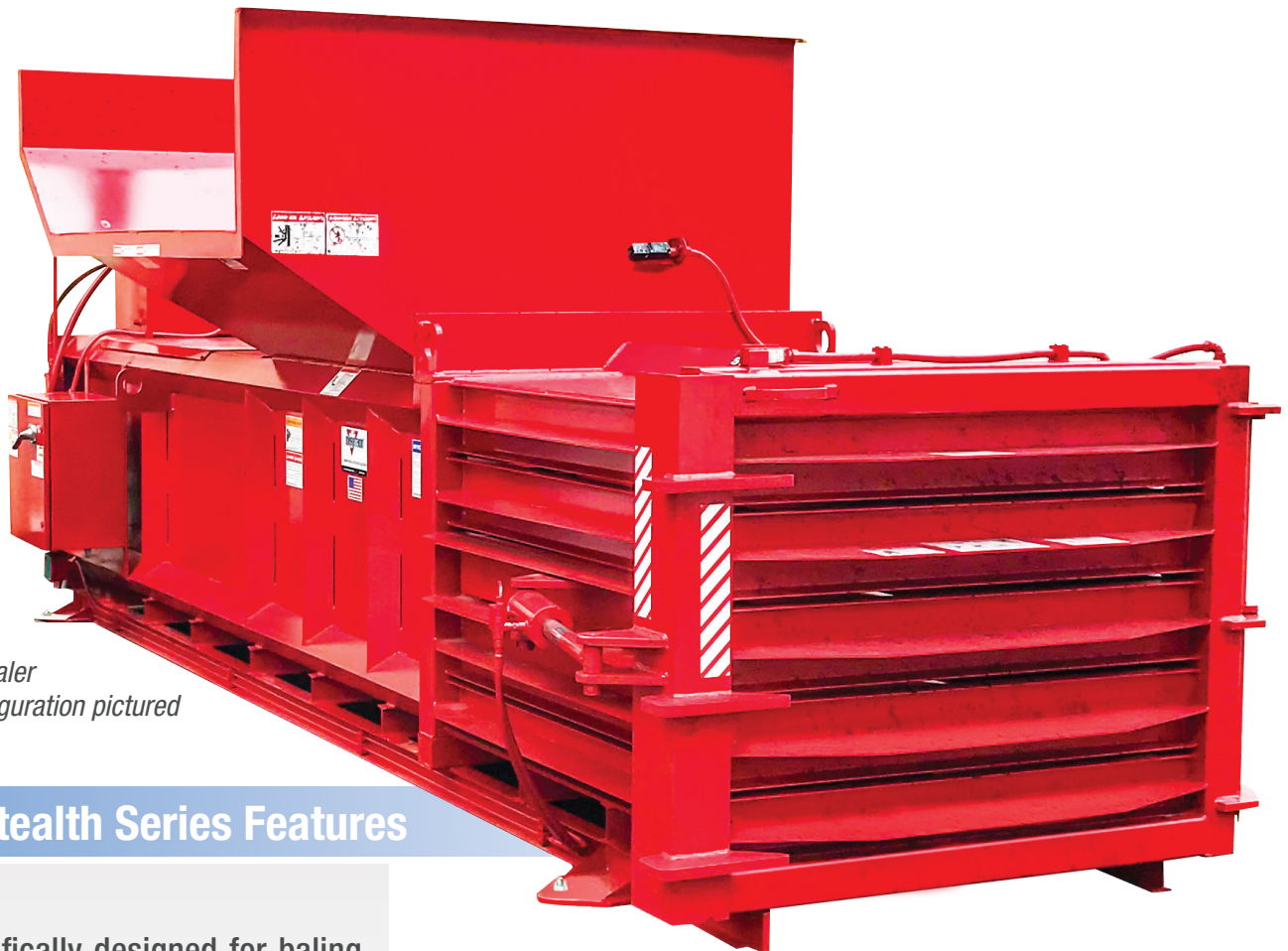
Stealth Baler 60" configuration pictured